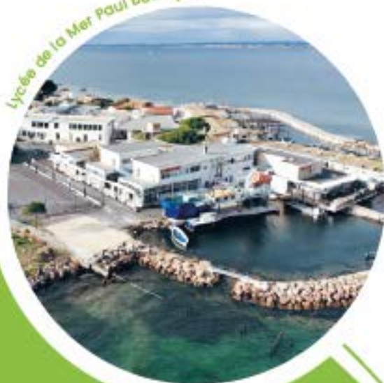
Lycée de la Mer Paul Bousquet